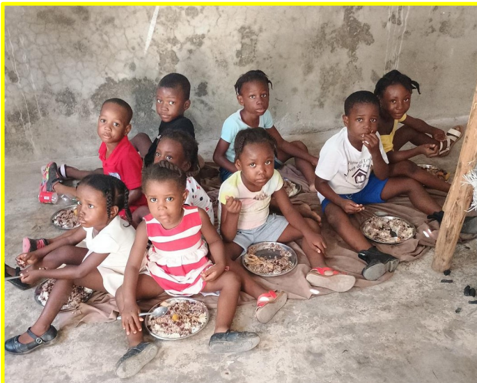
House of Love children eating on the concrete floor in the outside kitchen where meals had to be cooked.