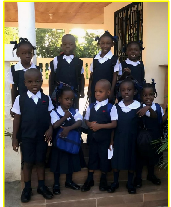
House of Love children ready for their first day of school for the 2025-2026 school year. The children attend school for 4 hours a day.