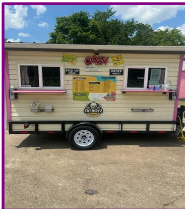
A huge Shout-Out to FATBOYZ SNOWBALLZ TRUCK! They donated 10% of sales to our Bangladesh & Haiti Outreaches.