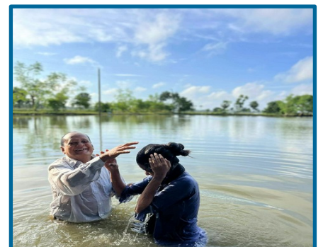
Agape Evangelist rejoicing after baptizing a young woman.